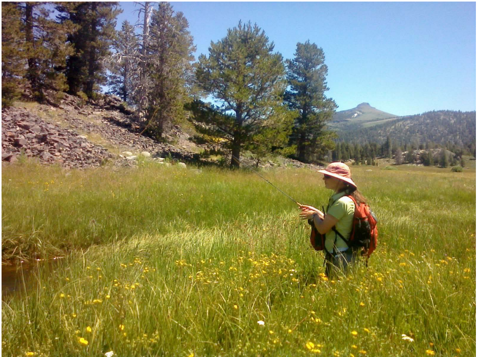
Molly sneaking up on some Red Lake Creek brookies.