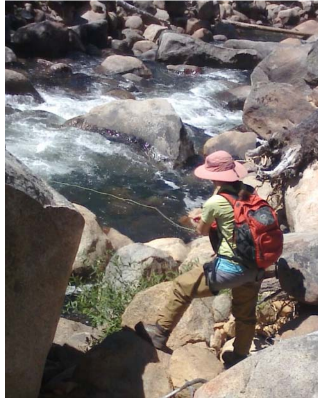
Molly on Silver Fork